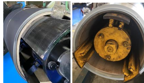
Figure 3: Over expanded mandrel caused by inconsistent torque transmission from mandrel to coil.