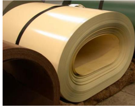
Figure 1: Coil slump (horizontal position)

Coil slumping or collapse is where the coil cannot hold-up its own mass and maintain the integrity of its cylindrical shape when it is stacked on its horizontal position (Figure 1). In particular, the inner bore of a slumped coil is distorted from a circular cross-section, and subsequent handling of the coil is impeded.