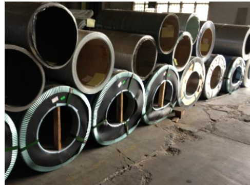
Figure 2: Improper coil storage areas