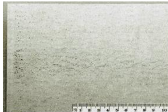
Galling on coated products

Sheets packs (flat sheets or roll-formed panels) with poor loading and transportation practice can also result in galling of sheets. If the sheets packs loaded on the truck was loaded with heavier item on top of the sheets, it will generate galling on the sheet pack due to pressure point.